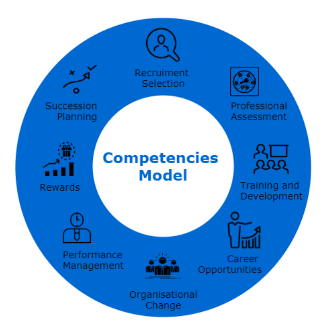
Figure 2: Competencies Model Components.

There are a number of developed competencies models for each industry and many of them could be used as a starting point when an organisation decides to build its own model. This research will focus on the creation of competency model for e-Platform for networked organisations. In order to better understand competencies, they can be broken into categories within the IT organisation. For the purpose of this research and creation of the competency model, an automated tool has been used called "Build a competency model tool" by Competency Model Clearinghouse located on the following internet address https://www.careeronestop.org/competencymodel. The website offers the option of building your own customized model with the preinstalled options for IT industry.