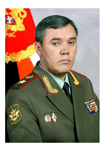
Figure 1: Valery Gerasimov, father of Russian hybrid warfare doctrine?

Yet, when analyzing the Russian example more closely, the results of hybrid warfare are somewhat mixed. Arguably, Russia's relative success in Crimea can be attributed to hybrid, or non-linear operations, however the deployment of special forces (aka "Little Green Men") with sanitized uniforms is hardly unique. More telling was the unprepared state of Ukraine's military and its inability to counteract any of the operational or political moves from the Kremlin. When looking at Moscow's efforts in the Donbas, what becomes clear is the hybrid component proved unsuccessful and only with the large-scale introduction of Russian conventional forces in August of 2014 did the situation stabilize in Moscow's favor. The result is in effect a new "frozen conflict" under Kremlin control.