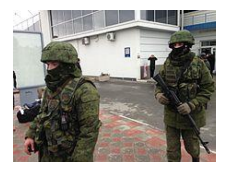
Figure 2: Little Green Men, Crimea, 2014.

Yet, when analyzing the Russian example more closely, the results of hybrid warfare are somewhat mixed. Arguably, Russia's relative success in Crimea can be attributed to hybrid, or non-linear operations, however the deployment of special forces (aka "Little Green Men") with sanitized uniforms is hardly unique. More telling was the unprepared state of Ukraine's military and its inability to counteract any of the operational or political moves from the Kremlin. When looking at Moscow's efforts in the Donbas, what becomes clear is the hybrid component proved unsuccessful and only with the large-scale introduction of Russian conventional forces in August of 2014 did the situation stabilize in Moscow's favor. The result is in effect a new "frozen conflict" under Kremlin control.