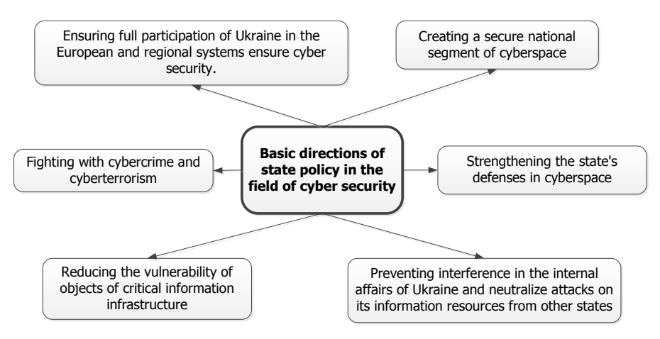
Figure 1: Basic directions of Ukraine's state policy in the field of cybersecurity.

Creating a secure national segment of cyberspace will help maintain an open society and ensure safe use of the cyberspace by the community. An important measure in this regard is to define mandatory requirements for critical information infrastructure facilities, protection of personal data, control for the protection of information circulating at such sites. It is necessary to develop a list of assets of critical information infrastructure, which include elements that are essential to the national security and defence of Ukraine. These objects urgently need to be protected against cyberattacks. Further, the efficient operations of cybersecurity and information security units must be ensured. In addition to that, effective measures to reduce the risk of threats to information and ensure security and protection of state information resources in information, telecommunication, and information and telecommunication systems must be taken.