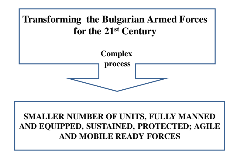
Figure 4: Goal of Transformation.