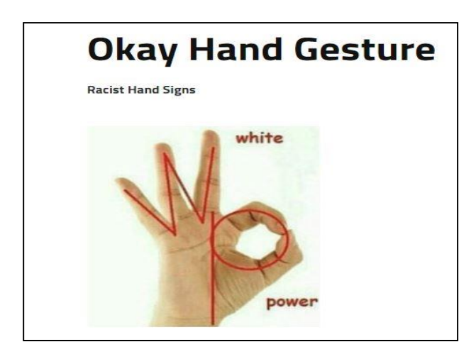
Figure 2: Okay Hand Gesture, © 2020 ADL.<sup>21</sup>

Important in assessing these newly created symbols is the context of their use. That is, the person who used them, on what occasion, and in short, if there is a possible subjective aspect. Criminal proceedings should hardly be initiated if a diver uses the above symbol. We might exaggerate and speculate what the procedure would be if the symbol is used by a diver who is demonstrably a rightwing extremist or by a right-wing extremist who has a diver's license. In cases where repressive action against these symbols is being considered, it is necessary to refrain from any speculation and artificial analysis; there is a need to act reasonably and not try to create criminal liability where there is none. In the case of excessive use of extremist symbols on social media and networks, it is necessary to require their participants to maintain a certain Internet culture and ethical behavior. The requirement may come either from groups on social networks or directly from the provider, who has the right to block and subsequently delete accounts showing an extremist and radical background.