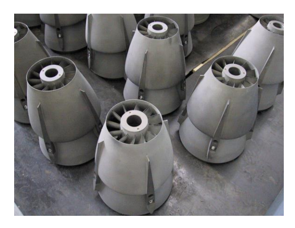
Figure 3: MU90 Pump-jet.

The weapon is powered through an Aluminium-Silver Oxide (AgO-Al) sea water battery using dissolved sodium-dioxide powder as electrolyte and incorporating an advanced closed-loop electrolyte re-circulation system. The hazard-free, pollution-free electrical power-plant of 120 KW (*) <sup>1</sup> does not only grant high speed and endurance but also high torpedo safety during transportation and carriage, reduced ILS infrastructure needs and no disposal costs. The replacement of the one-shot sea-water propulsion battery with a multi-firings rechargeable battery for exercise live trials further minimises the LCC of the weapon.