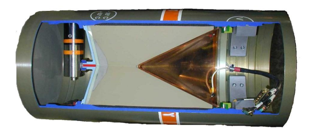
Figure 5: MU90 Warhead Cut-way.

The fully-insensitive directed energy shaped charge warhead (see Figure 5) composed of V350 explosive, proven to penetrate double hulled large submarines, grants killing capability at any operational depth, including close-to-the-sea surface operational situations where the effectiveness of any blast-charge torpedo warhead is heavily jeopardised. The impact-type \mu\text{-processor-controlled} exploder is of advanced design and exploits front-located sensors to trigger the explosive chain well before any premature mechanical deformation caused by the torpedo hit may compromise its functioning. It incorporates mechanical and electrical independent safety devices. The warhead fully meets any STANAG safety requirement.