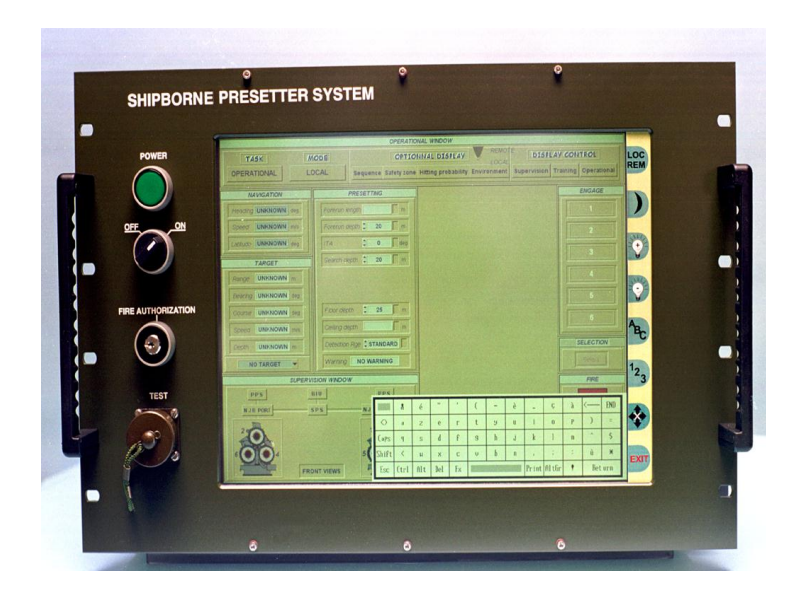
Figure 6: Shipborne Presetter.

The all-in-one automatic torpedo test equipment TTU 102 allows an easy computer-driven preventive and corrective maintenance throughout the system shelf life. The modern approach to the MU90 ILS renders the 30-years Life Cycle Cost of the weapon significantly low with respect to all the existing torpedo systems and furthermore it minimises the need for significant infrastructures and human resources.