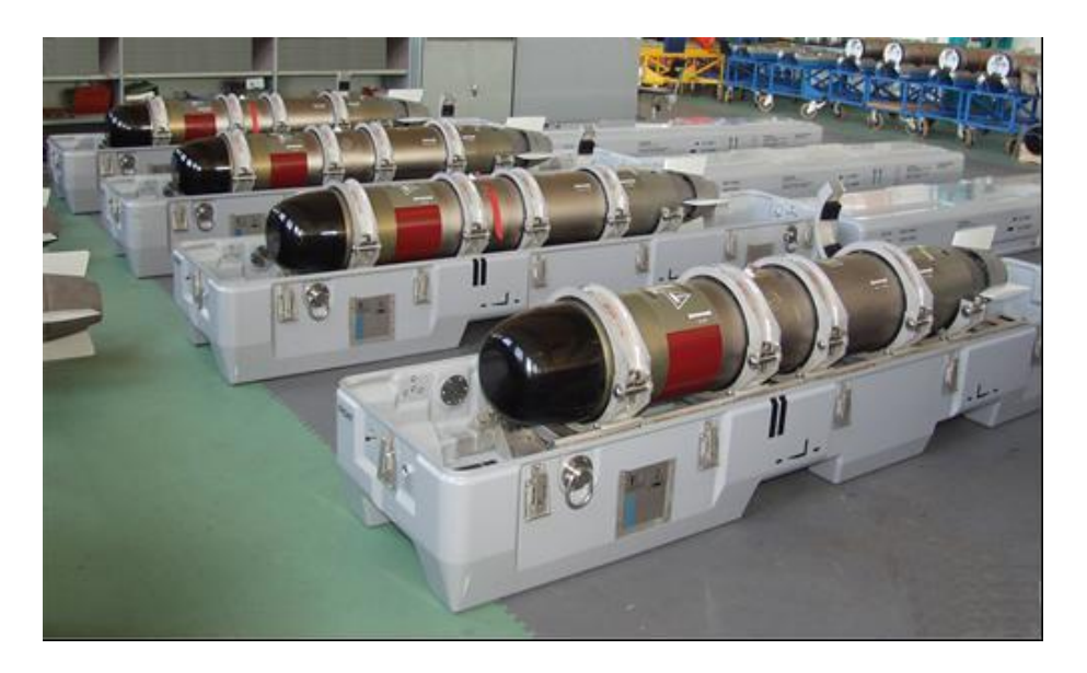
Figure 1: MU90 Torpedo Mass Production.

points in strategic waterways where diesel submarines can exploit the restricted waters at their great tactical advantage. All listed features combined with the proliferation of expendable anti-torpedo countermeasures result in an extremely hard life to its primary threat: the Light Weight Torpedo (LWT) .