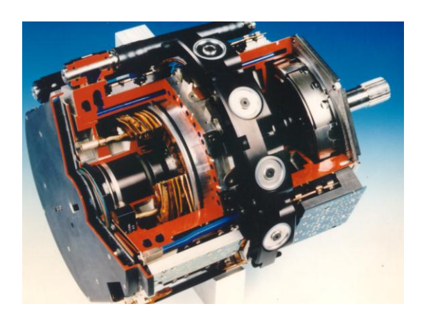
Figure 2: MU90 Motor.