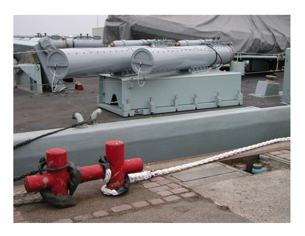
Figure 7: Example of B515/2/F Torpedo Launching Tubes.

Based on advanced Man Machine Interface techniques meeting the modern requirements of automation and permitting consolidation of fire control and weapon systems functions, these computerized systems are built to fulfil turn-key stand-alone , par-