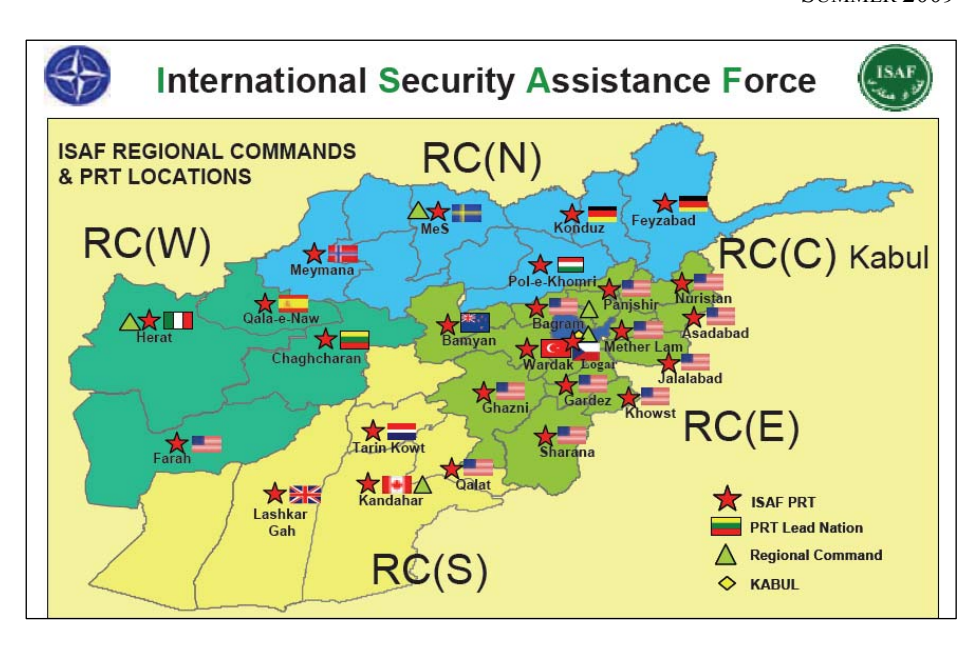
Figure 3: Location of Provincial Reconstruction Teams in Afghanistan.