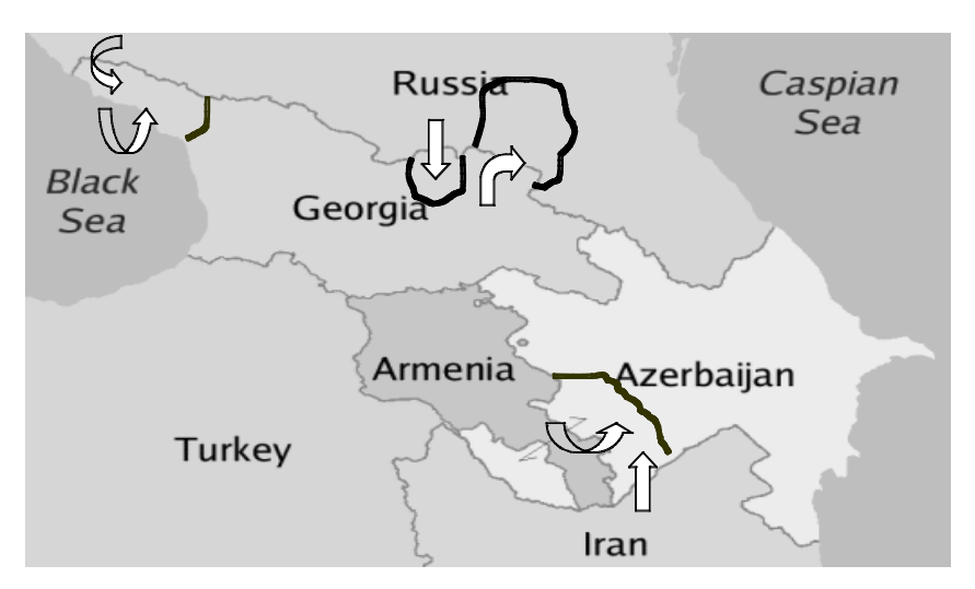
Figure 4: Weapons trafficking routes in the Caucasus

particularly engaged in weapons smuggling (among other activities) within their operation areas, which include Mingrelia, the Gali district, and the Kodori Gorge in western Georgia. Similar phenomena take place in Chechnya and Dagestan, where local terrorist and insurgent groups purchase weapons from Russian sources and disperse them to the population for operational or commercial purposes. At the same time, some high-end weapons, like man-portable air defense systems (MANPADS), are smuggled into Chechnya and Dagestan from abroad. In the summer of 2002, Chechen insurgents managed to smuggle several dozen MANPADS across the Georgian-Russian border to Chechnya. The Chechen insurgents subsequently shot down several Russian helicopters, resulting in the loss of a high number of personnel and posing serious implications for operations, which lasted until the end of the year.<sup>25</sup>