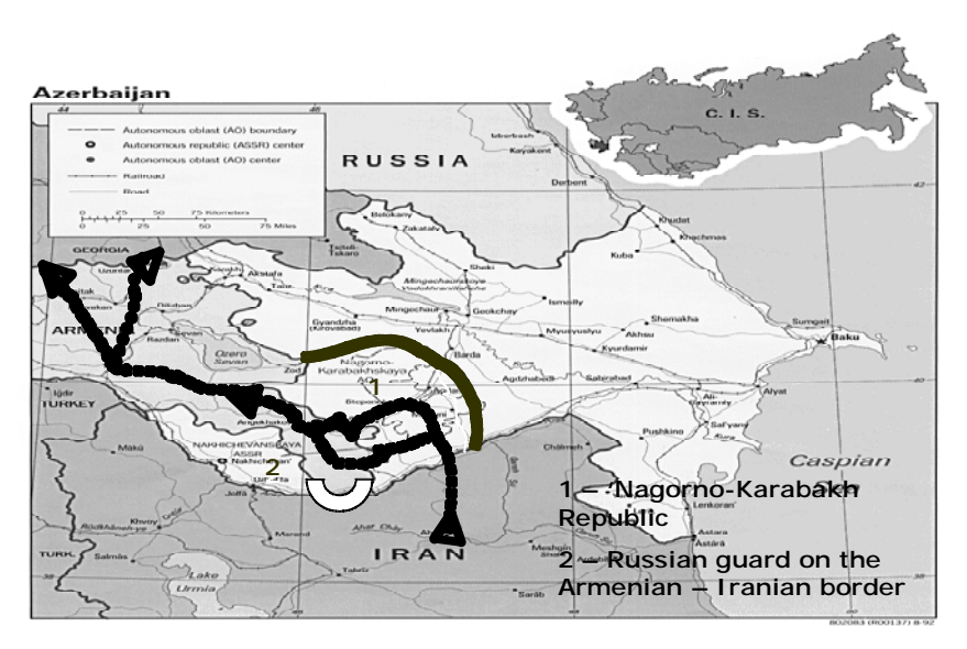
Figure 7: The Nagorno-Karabakh "black hole"

package financed by the Export Development Bank of Iran.<sup>46</sup> From this vantage point, smuggled goods (or people) can move out of Armenia via the only two available routes: either the Megri-Goris-Yerevan-Tbilisi route (Route E-117) or the Megri-Yerevan-Ashtarak-Kutaisi route (Route A-82). Georgia thus serves as a "distribution center" to the outside world, providing a link to Turkey, Russia, Ukraine, and Western Europe.