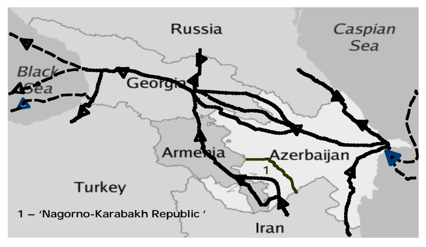
Figure 5: Drug trafficking routes in the Caucasus

ther in person by couriers (e.g., within the human body) or in unaccompanied commercial cargo shipments. The items trafficked range from low-grade, label "555" heroin to high-quality, label "999" heroin. There is also an increasing flow of cannabis from Iran, as well as cocaine and marijuana from Russia, which is mostly delivered by messengers, arriving by legal means of transportation, such as automobiles, trains, or ferries. The pool of traffickers is international. Perpetrators detained for drug-related crimes in the first half of 2006 in Azerbaijan (in addition to local citizens) included forty-seven foreign nationals (twenty-three from Georgia, fifteen from Iran, and others from Russia, the Central Asian states, and Afghanistan).<sup>28</sup> Azerbaijan pays a high price for its strategic position, one negative backlash of which is the transit of illicit drugs, many of which filter into the Azeri population. There are 300,000 drug users in the country, among them 15,000 to 18,000 (including teenagers) who are addicted to hard drugs.<sup>29</sup> Over the last year, drug-related crime rates in Azerbaijan rose by more than nine percent. The drug issue has risen to a national-level security threat. (For the main drug trafficking routes in the region, see Figure 5.)