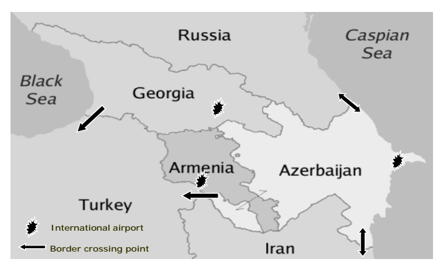
Figure 6: Human trafficking routes in the Caucasus