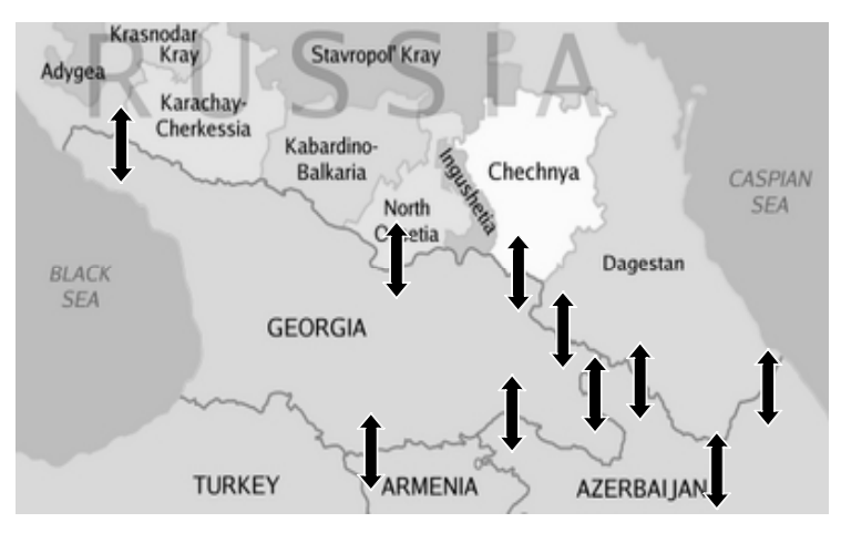
Figure 2: Cross-border ethnic kinship

veillance system in the Nakhchevan enclave will be introduced no earlier than 2010.<sup>14</sup> The Azeri-Turkish border, however, being a mere fifteen kilometers wide and having only a single border-crossing point at Sadarak, is firmly controlled.